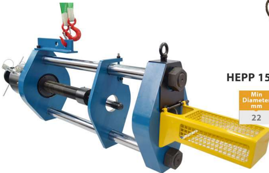
HEPP 150T Manual / Electric